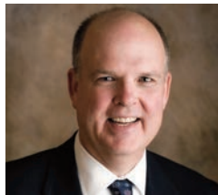
John Reed Rochester International Airport