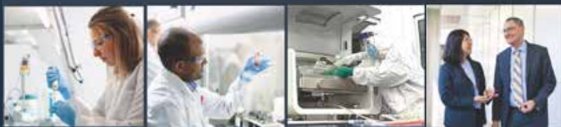
Research & Development

Phase 1-2 trials with our targeted oncolytic viruses, as monotherapies and in combination with immunotherapy drugs are underway in multiple cancer indications.