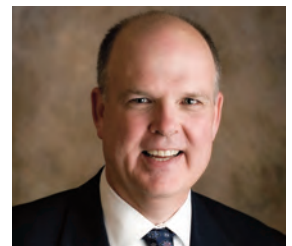
John Reed Rochester International Airport