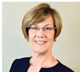
Mayor Kim Norton City of Rochester