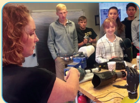
Student tour during SE MN Manufacturing Week