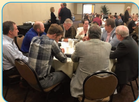
SE MN Manufacturing Forum