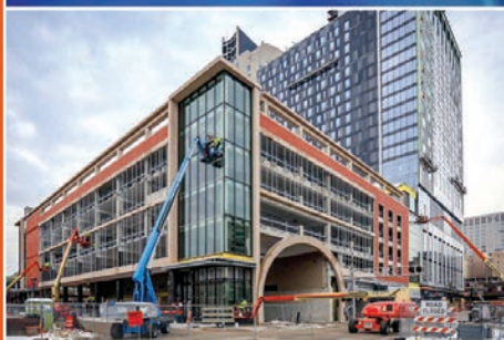
City of Rochester Parking Ramp #6 and Hilton Hotel

Building Enduring Relationships and Strong Communities