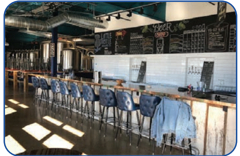
Little Thistle Brewing Co. receives an SBA 504 fixed-asset loan.