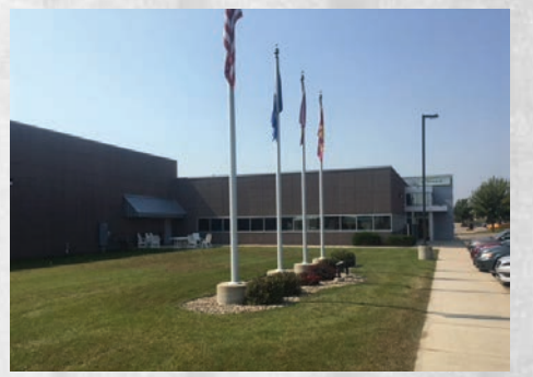
Pace International announced a $2 million expansion in 2017 with plans to create 22 new jobs. RAEDI worked with the City of Rochester and Pace Electronics to obtain a $196,000 grant through the Job Creation Fund.